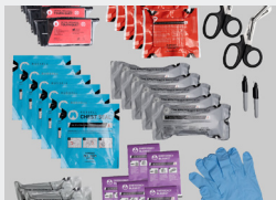
Stop the Bleed Kit 5-Patient (PP0047)