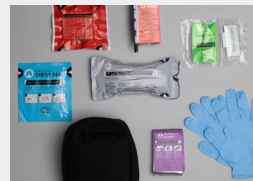
First Aid Kit Individual (PP0048)