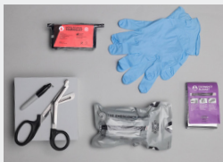
First Aid Kit Basic Refill (PP0051)