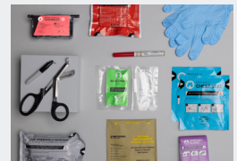
First Aid Kit Advanced Refill (PP0053)