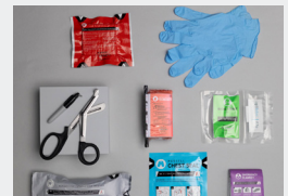
First Aid Kit Individual Refill (PP0049)