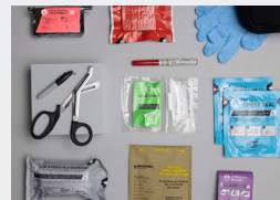
First Aid Kit Advanced, CE (PP0052)